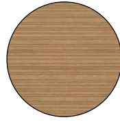
3D Walnut Décor