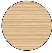
3D Oak Décor