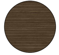
3D Wengé Décor