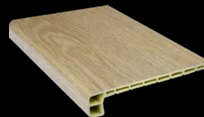
Winter Wheat IPWTWSN