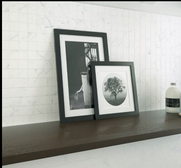
CARRARA THROUGH BODY PORCELAIN HONED - RECTIFIED